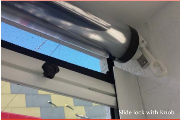
Slide lock with Knob

The Channel blind is ideal where the convenience of the crank roller system is required but the ability to fix the blind at various heights with no gaps down the sides is a must.