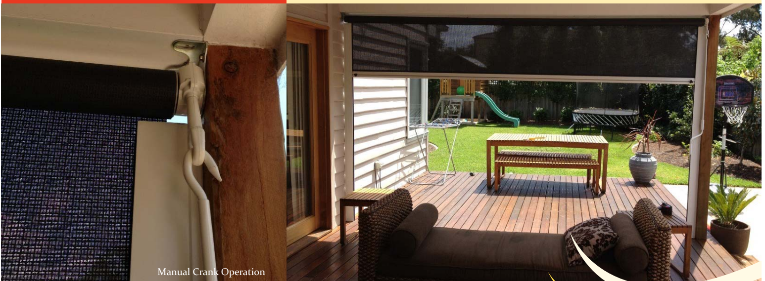
Manual Crank Operation